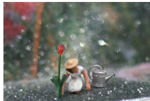
Title: The Seed Code: GC019 Description: Woman gardening