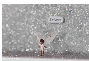
Title: Believe Code: GC004 Description: Tiny fairy