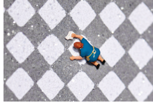
Title: Cleanliness is Next to Godliness Code: GC005 Description: Woman cleaning floor