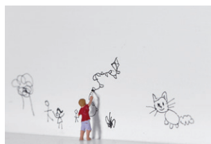
Title: An Utter Disregard for Consequences Code: GC003 Description: Child drawing graffiti