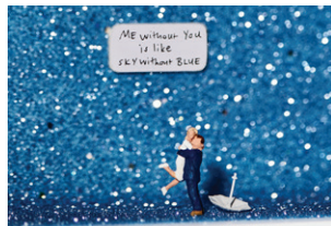
Title: Me Without You is like Sky Without Blue Code: GC010 Description: Man and woman embracing in rain