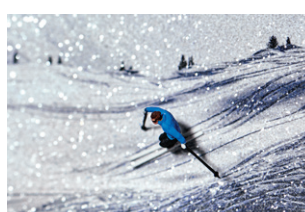
Title: Happy Trails Code: GC008 Description: Man skiing