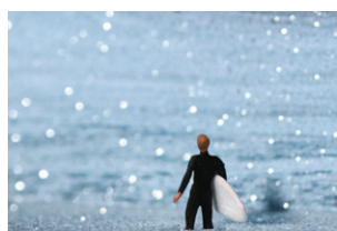
Title: Open Canvas Code: GC012 Description: Man waiting to surf