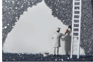
Title: The Nightjob Code: GC013 Description: Man painting the night sky