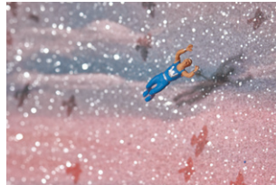
Title: Flight Code: GC006 Description: Man flying