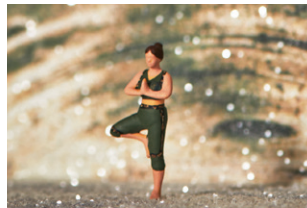
Title: The Yoga Tree Code: GC015 Description: Woman in 'tree' yoga pose