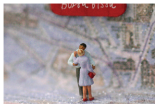
Title: Bisou Bisou Code: GC018 Description: Man and woman embracing, Paris map