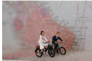
Title: All the Days Code: GC017 Description: Man and woman cycling, world map