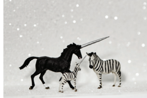
Title: It's All Magic Code: GC009 Description: Unicorn, zebra and baby zunicorn