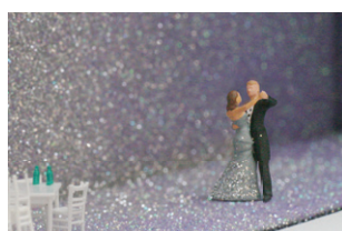
Title: Dance Me to the End of Love Code: GC020 Description: Man and woman dancing