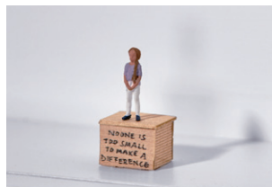
Title: No one is too Small to Make a Difference Code: GC011 Description: Greta Thunberg on soapbox