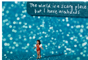
Title: The World is a Scary Place, but I have Waterwings Code: GC014 Description: Swimming girl in waterwings