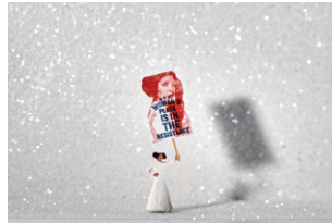
Title: A Woman's Place is in the Resistance Code: GC001 Description: Princess Leia activist