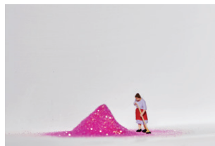
Title: A Woman's Work Code: GC002 Description: Woman sweeping pink glitter